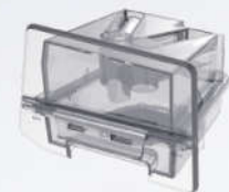
Efficient heating humidifier system