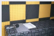
Whisper quiet light and compact